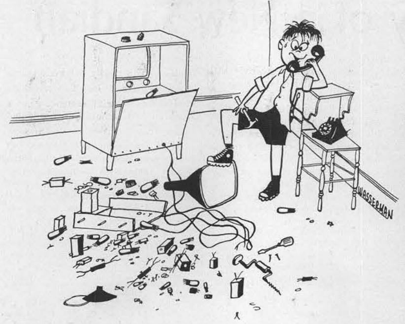
Hey, Dad, do the book racks have any information on fixing TV sets?

Magicians Award Cup to Member Who Stumped Them